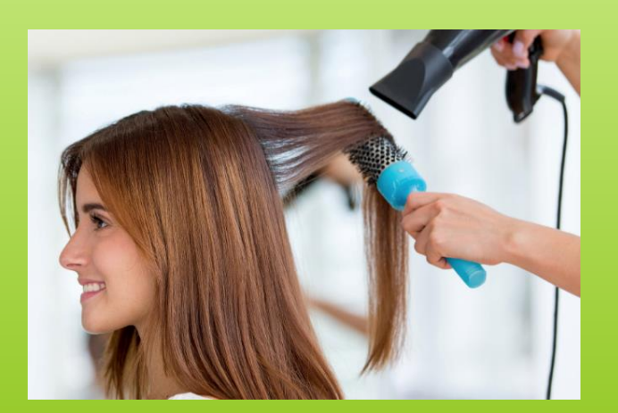
HAIR AND BEAUTY Basic vocational training

Make up. Nails. Waxing. Basic beauty treatments... and more.